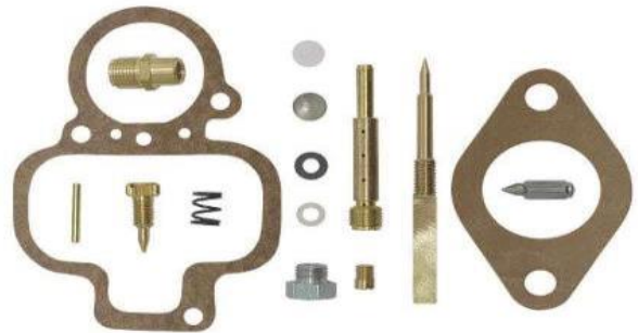
Marvel Shebler Model A or B