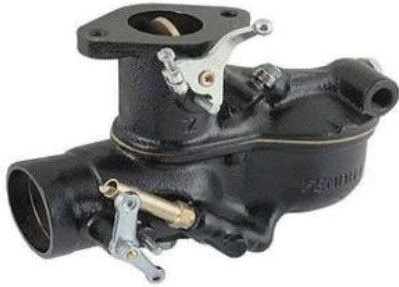
Zenith Model A

When ordering parts or looking up adjustment specs for your carburetor, it is important that you identify which one you have. Below are 4 of the most common carbs used on a Model A with the gasket sets they use, which gives you a feel for the shape of the casting and bowl. Until next time, Have a Model A Day! Jim