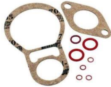
Tillotson Model A