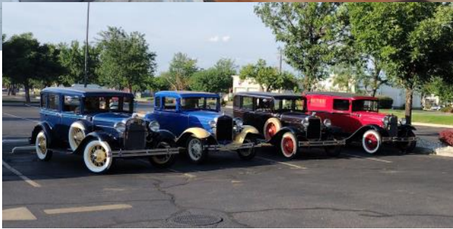
Above pictures are FFF at Arby's August 4th.