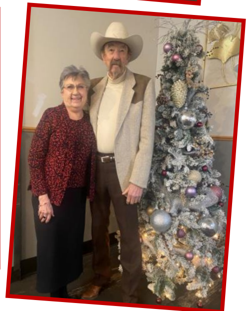
More Christmas Party Pics