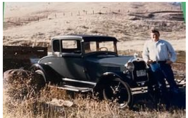
Restored Coupe in the same spot in Nampa