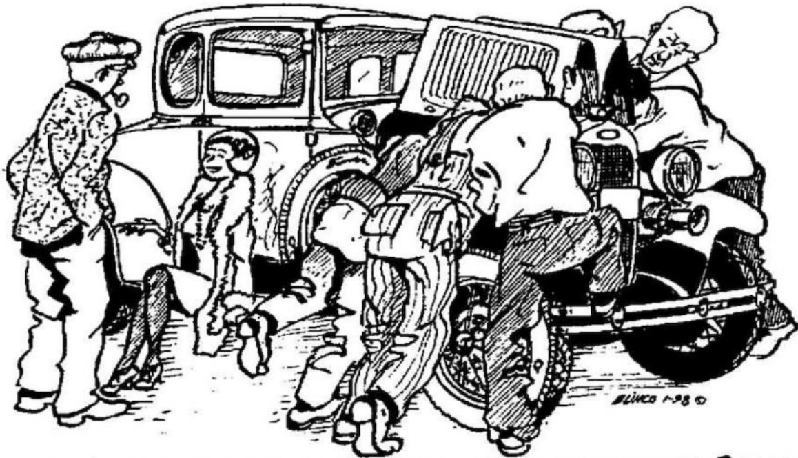
YOUR RIGHT DAD..THE "A" REALLY ATTRACTS THE GUYS