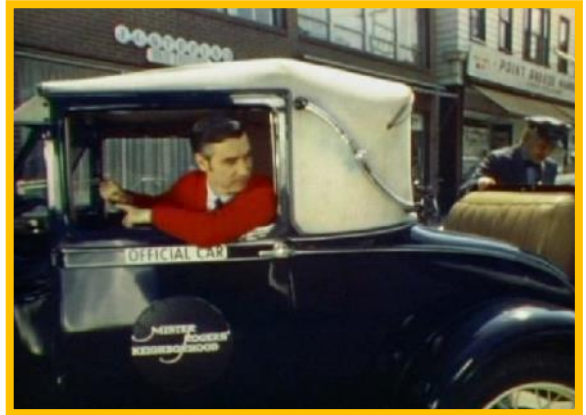
Fred Rogers in 1928 Sport Coupe he featured on his TV show "Mr. Roger's Neighborhood" (right)