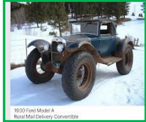
1930 Ford Model A Rural Mail Delivery Convertible