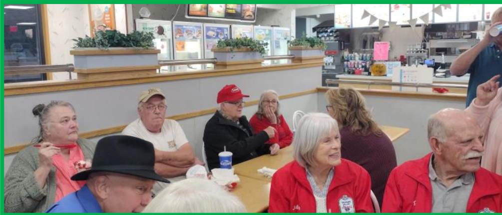
This location was large enough to accommodate our group of 20 with plenty of room for other patrons. Folks stayed to laugh and share stories.