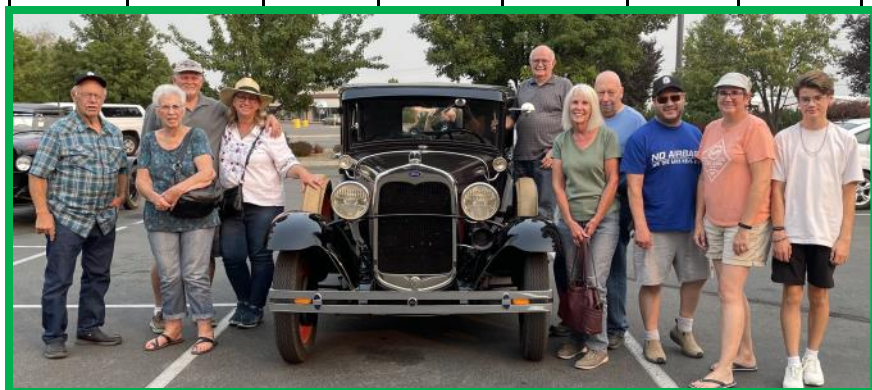
Fast Food Friday August 18th at Arctic Circle.

Local Events: Mechanics Garage: Hightower's Garage: call Elvin to schedule the day and time to get expert help with your project. Next Club Meeting October 12, 2023, Bob's Restaurant & Lounge, 1411 Shilo Drive, Nampa, Idaho 83687 Dinner at 6:00 p.m., Meeting at 7:00 p.m. Fast Food Fridays September 22: Sonic, 1535 S Celebration Ave, Meridian September 29: Freddy's, 1395 N Happy Valley Road, Nampa October 6: Chick Fil A, 2012 N Eagle Road, Meridian October 13: California Mexican Food, 10889 W Fairview Road, Boise October 20: A&W, 145 E Maine Ave, Nampa October 27: Dairy Queen, 107 E Water Tower, Meridian (Final FFF of the year) FFF Meet at 6:00 p.m. for a meal or dessert and an opportunity to socialize with other Club members. (Ladies – No cooking or Dishes to clean.)