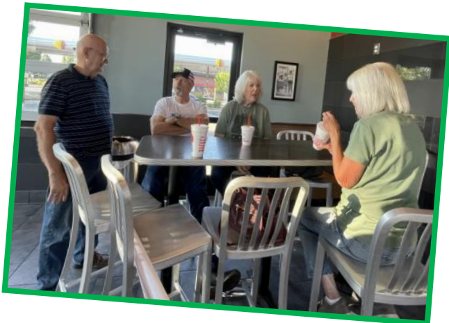
Fast Food Friday August 25th at Sonic Drive In