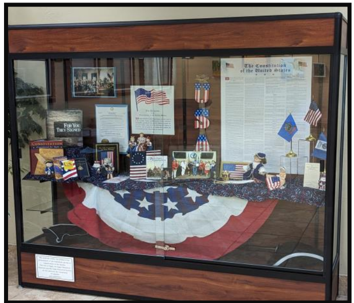
Constitution Display in Eagle City Hall

The second state to enter the union was Pennsylvania , which occurred on December 12, 1787. Named for one of the founders of the colony, William Penn, and the Latin word "Sylvania" meaning "forest," Pennsylvania's state flag is composed of a blue field on which is embroidered the State Coat of Arms. The first State Flag bearing the State Coat of Arms was authorized by the General Assembly in 1799. An act of the General Assembly on June 13, 1907 standardized the flag and required that the blue field match the blue of Old Glory.