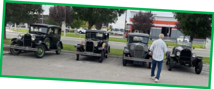
FFF Gathering September 1st at Carl's JR.