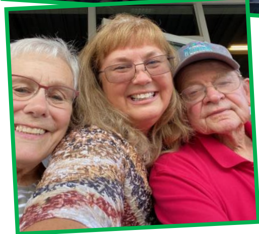
FFF at Tin Roof Tacos on August 8